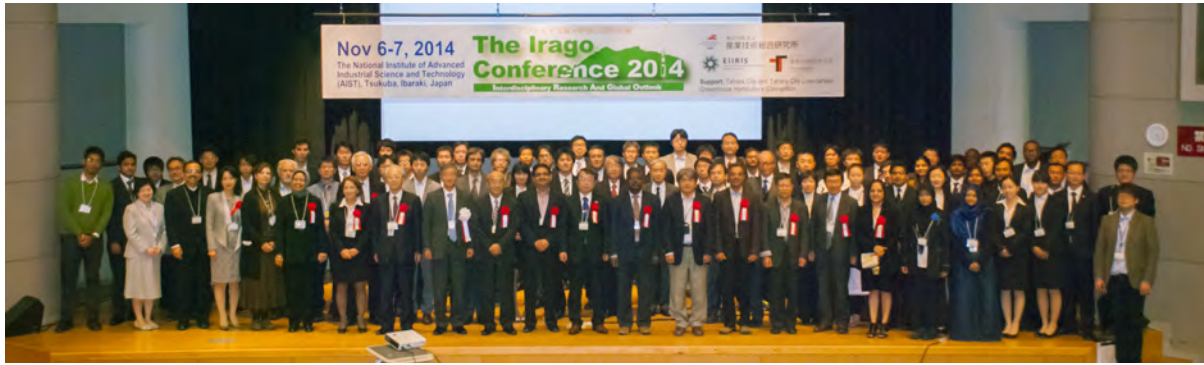
Conference photo of The Irago Conference 2014 in Tsukuba, Ibaraki